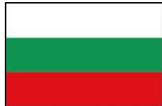
Republic of Bulgaria