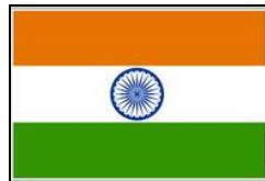
Republic of India