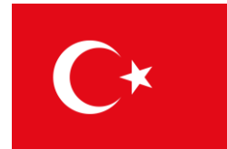
Republic of Turkey