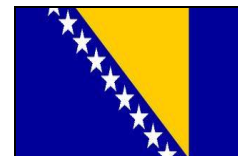
Bosnia and Herzegovina